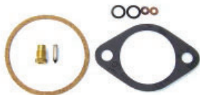
Carby Kit Part No: FK10102-1