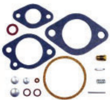
Carby Kit Part No: FRK739