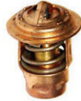
Thermostat 50 ° Part No: 14586