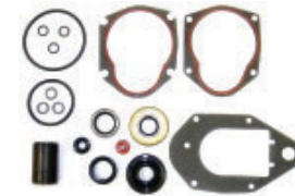
Gear Case Seal Kit Part No: 26-814669A2