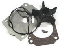
Water Pump Repair Kit Part No: 12012