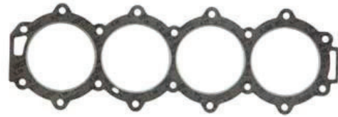
Head Gasket Part No: 27-824615