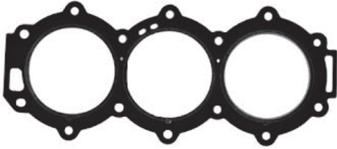
Head Gasket Part No: 27-820438