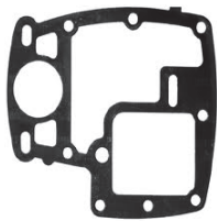
Base Gasket Part No: 27-819381-4