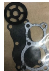
Chrysler/Force Fuel Pump Kit Part No: CF2801