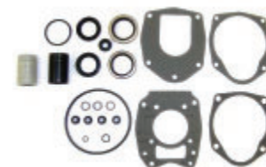
Gear Case Seal Kit Part No: 26-43035A4