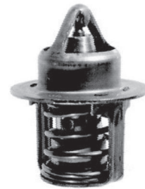
Thermostat Part No: 396987M (Metal) Part No: 396987 (Plastic)