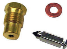
Needle and Seat 6-150HP Part No: 1395-9258