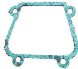
Transfer Port Gasket 40, 50, 70, 90, 120, 150 HP Part No: 27-820500A3