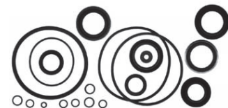
Gear Case Seal Kit 2 Piece Gear Box Part No: FK1203-1