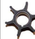
Impeller Part No: 47-F84065