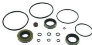
Gear Case Seal Kit 1 Piece Gear Box Part No: FK1063-2