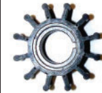
Impeller Part No: 47-F40065-2