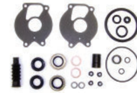
Gear Case Seal Kit Part No: 26-85090A2