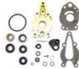
Gear Case Seal Kit Part No: 26-41365A3